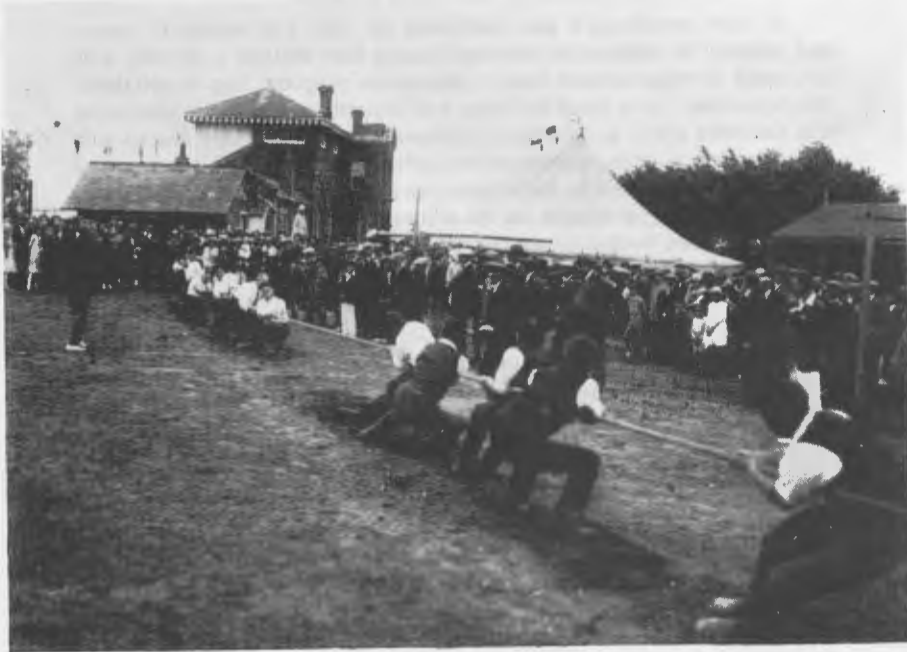
Galleywood Flower Show, Circa 1925