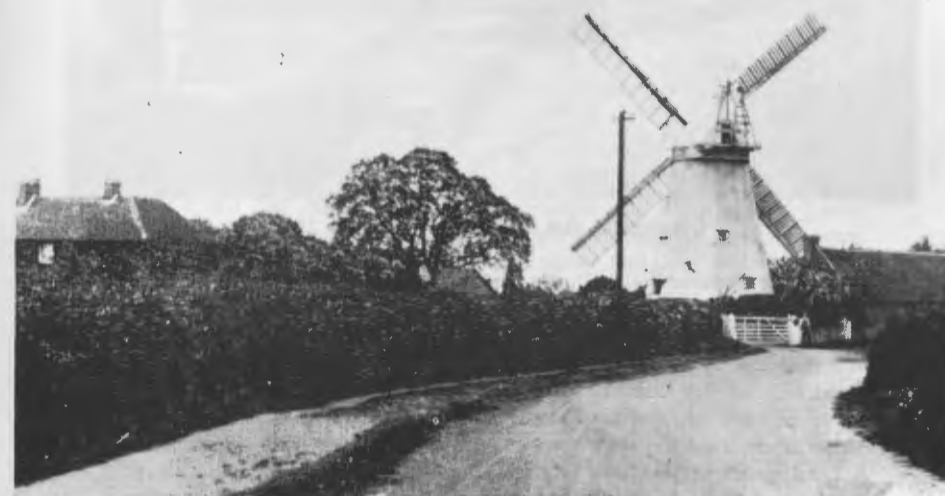
Former Windmill on the Common