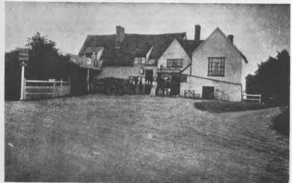
The Old Running Mare, Circa 1914

The last named was originally known as The Running Stream because from the pond just outside, a stream ran along Slades Lane and thence into a ditch by the football field to join another stream crossing Galleywood Road by Stomps Garage. In 1803 a local newspaper mentioned The Running Mare as the place where a poor woman sought shelter after being robbed by two soldiers of 13/- which she had earned selling home-made sausages. Maybe they were from the Uttlesford and Clavering Cavalry encamped that year on the Common while George III's Generals