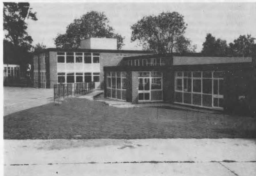
St. Michael's C.E. Junior School

with iron "blakeys" to give longer wear and the older ones might sometimes help the tinies along with pick-a-back rides. The girls' dresses were long, thick and invariably of a dark colour which would not "show the dirt" and over them they wore pinafores and perhaps sported a ribbon in their hair. Boys had large white celluloid collars over their thick dark jackets with small bow ties and the trousers of older boys were fastened