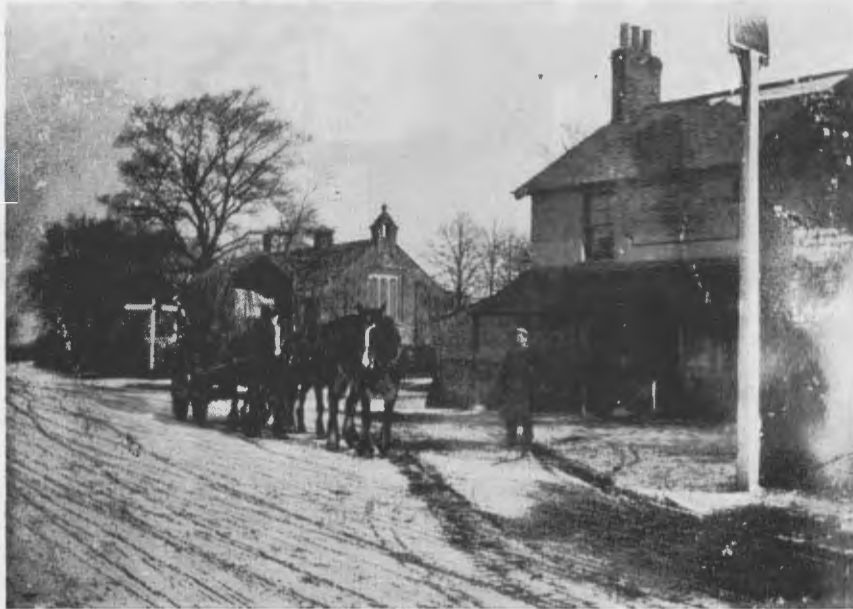
Old School and the Eagle Inn, Circa 1907

In the same way Galleywood's two windmills had their day and were used no more when their primary duty of grinding the farmers' corn was