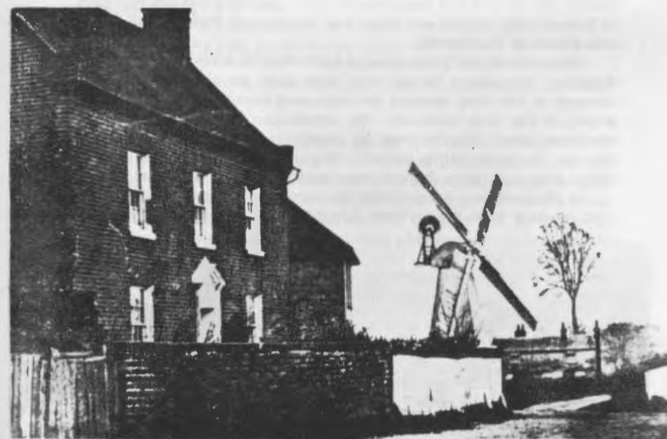
Former Windmill in Ponds Road