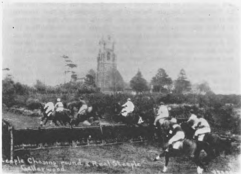
Steeplechasing, Circa early 1920's

In 1893 a golf course of nine holes was laid out on the Common; all the hazards were natural, some being the remains of entrenchments thrown up when it was feared that Napoleon was about to invade. The outer defences against Bonaparte were between the top of London Hill and the Church. A clubhouse was built on to the Horse and Groom public house and local boys earned pocket-money as caddies until new links at Widford made the Galleywood course redundant.