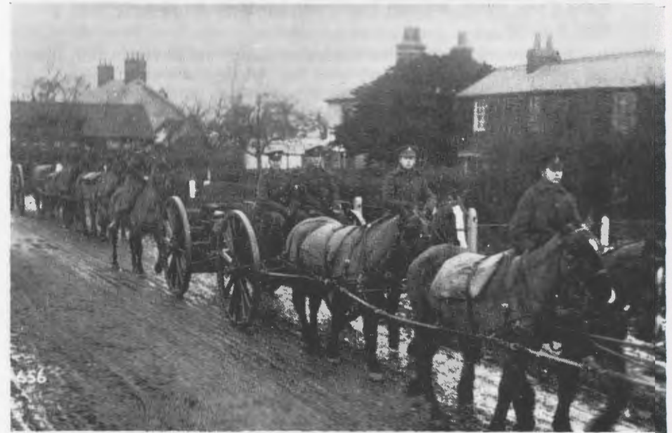
Army Convoy through Galleywood 1914 - 1918